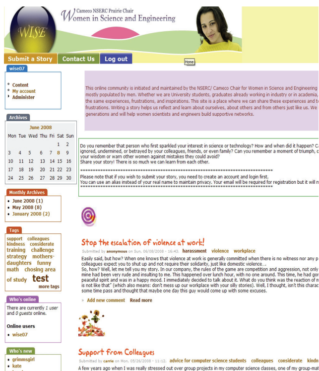
Figure 1. The Interface of the Community

stories and comments. In this way personal relationships can be developed. We wanted to give women a feeling of security to share personal experiences without the fear of being targeted or identified. Therefore, we incorporated two guidelines in our design; first, users can use aliases when submitting their stories, and they can create as many aliases as they want. Second, in the policy of use, users are discouraged from referring directly to certain individuals or organizations in their stories. After being submitted, stories are moderated before being published, to ensure the privacy of the authors and any other persons / institutions mentioned. To encourage building relationships and common bond [15] we followed Kim's recommendation for allowing users to build profiles [10] and allowed registered users (members) to be represented by avatar icons of their choice, which also adds to the visual appeal of the community. The registered users can see who is online at the moment and who is a new user (see Figure 1, left bottom part of the screen).